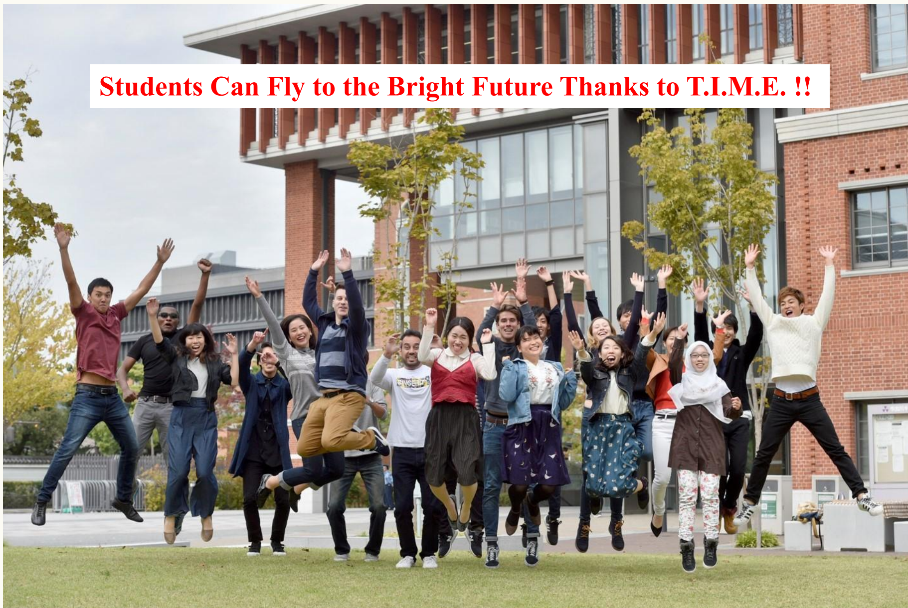
Happy students @ Doshisha

Students Can Fly to the Bright Future Thanks to T.I.M.E. !!