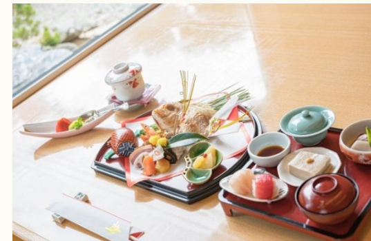
Japanese-style set menu meal