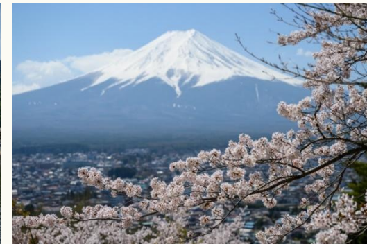
Mt. Fuji and Cherry Blossom