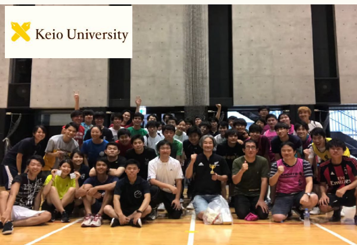
Laboratory Trip (Miki Lab.)